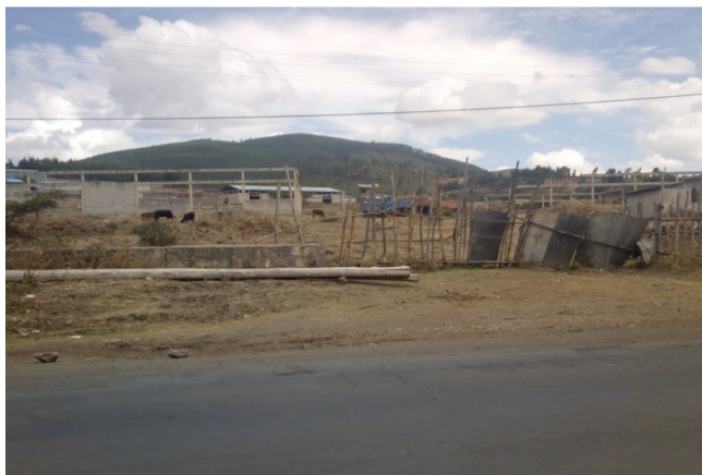
Figure 9: Land taken for investment and simply fenced for eight years without expected purpose (Source: Photo taken during field observation on May, 13, 2019).

The following photo was taken during field observation by the researcher to identify investment related challenges in the town administration. It shows that although some investors have implemented their projects and the local communities are started to benefit from those investments in a direct or indirect ways, but numbers of projects like shown in photo below started in 2011, it is about eight years old has laid to failed to use the allotted land in spite of the fact that the developers are obliged to operate and make the local people, themselves and government beneficiaries.