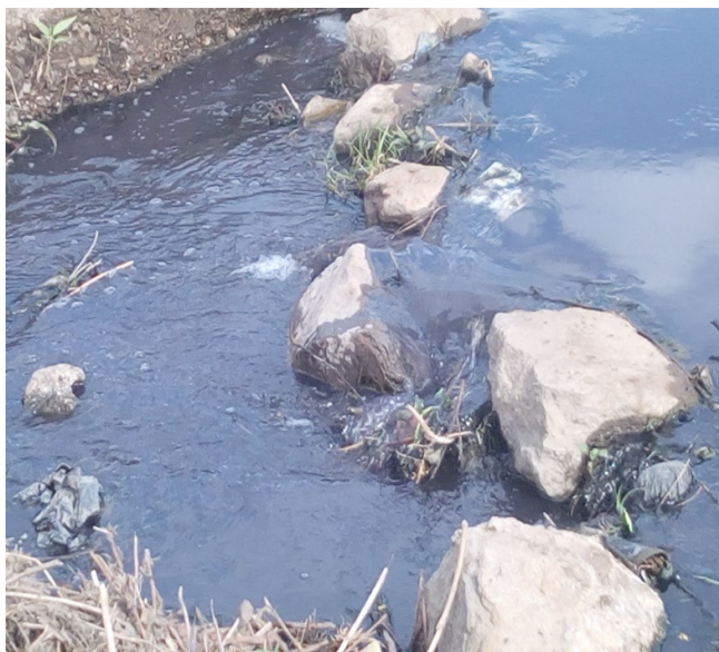
Figure 8: Liquid wastes discharging to the river (Source: Photo taken during field observation on May, 2019).

One of the participant of the focus group discussion said that, “we sometimes use the polluted water for irrigation, we have no another option but it will affect our health, i.e. resulted in itching of our leg and feeling of discomfort on our health. We will farm it when the rain is coming at least it decreases its pollution effect”. According to data obtained from interview with town’s Environmental Protection and Greeneries office, some investment projects became environmental challenges. For instance; Haffede Tannery Industry has been built on the side of the river and Finfinne (Addis Ababa) to Jimma main road. It discharges liquid wastes to the river without proper treatment. Due to this, decision to close taken over it in 2017. However, sister company (garment) inside it still on working.