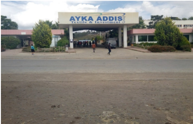
Figure 4: Partial photo of Ayka Addis textile and Investment (May, 07, 2019).

factory is seen in the following photo that was taken by the researcher during field observation.