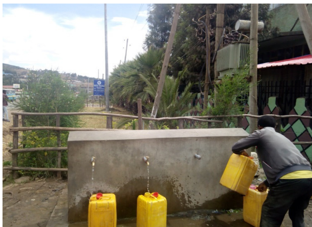
Figure 6: Water provided by Best Plastic Factory for public (Source: Picture taken by the researcher during field observation on May, 2019).