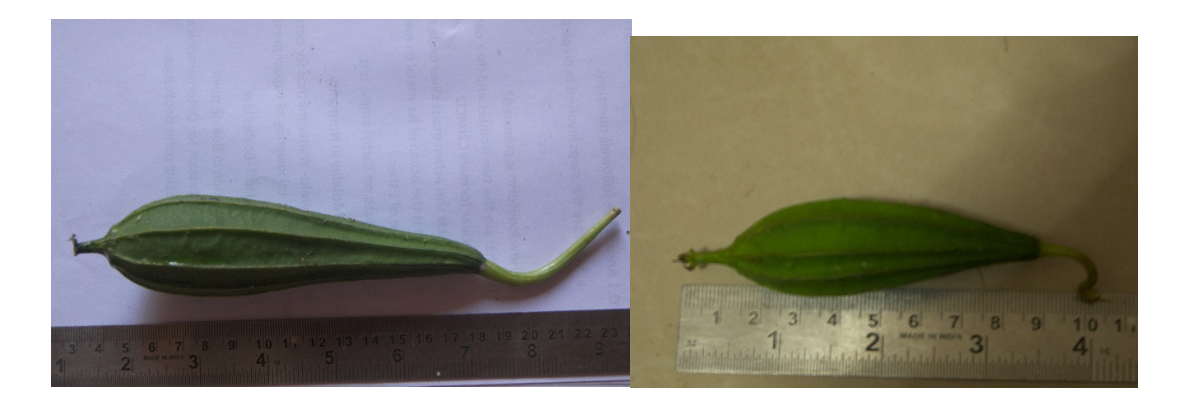
Figure 2: Phenotypic Plasticity in fruits of L. amara

Table 1: Morphological variations in fruit sizes at different sites (Fruit plasticity).