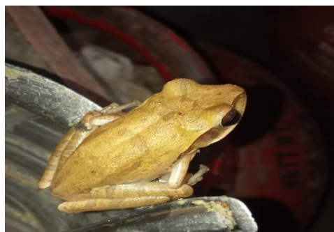
Pankaj-Fig 02. Undisturbed common Indian treefrog, Polypedates maculatus (Gray) with almost no spots or patches on dorsum and legs, obtusely pointed snout, and nostril closer to the tip of the snout.