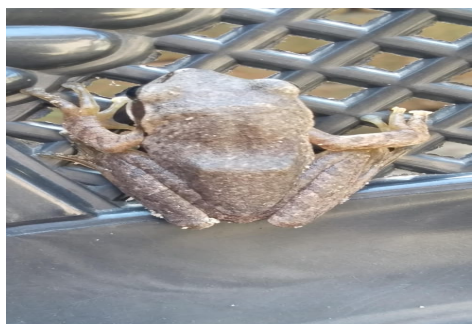
Pankaj-Fig 01. Stationary treefrog, Polypedates maculatus(Gray) with sacral vertebrae forming a pair of distinct elevations on the back, narrow waist, fingers without web, tips of fingers and toes dilated into spherical adhesive discs.