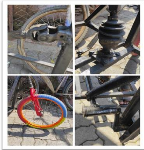
Fig: Model of Handicap Cycle