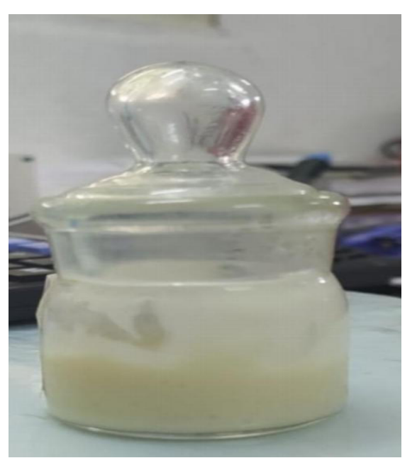
Fig- cocoa butter Anti stretch mark cream