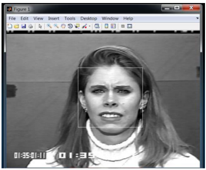
Fig input image Matlab 2014a has been used above fig shows input image of given algorithm