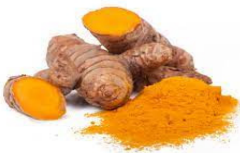
Fig. 2: Turmeric.

Turmeric also prevents ulcer formation in rats exposed to gastrointestinal irritants such as stress, alcohol, indomethacin, reserpine, and pyloric ligation by increasing stomach wall mucus (Yadav et al., 2013). It also reduces intestinal spasm and boosts the release of bicarbonate, gastrin, secretin, and pancreatic enzymes (Rolfe et al., 2020). Curcumin is a nontoxic, high-potential natural antioxidant with a diverse set of biological consequences. Pure curcumin is now available, demonstrating a broad range of biological functions. These findings show that curcumin may be useful in treating COVID-19-induced myalgia and fatigue (Horowitz et al., 2020). Following significant research into it has a huge impact and develops a mode of action which will be easier to build new medications based on this. Curcumin is likely to be used in the upcoming years, as a novel treatment for treating a variety of diseases, illnesses, and oxidative stress (Soleimani et al., 2018).