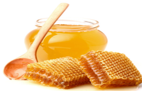
Fig. 3: Honey.