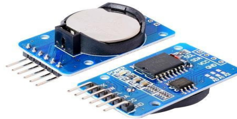
Fig.no.1 RTC Modular

Our project system will have 2 water pump, RTC modular, power supply, 2 relays, Micro-controller (ATMEGA8), LCD display 2 button. By programing RTC we can see the real time in display. Pressing enter first we can select aera 1 or 2 and press select the area is selected and again press enter for selecting ON time and then press select to updating ON time. After selecting on time, we can press enter to select OFF time and then press select to update Time and the pump will operate on the giving time