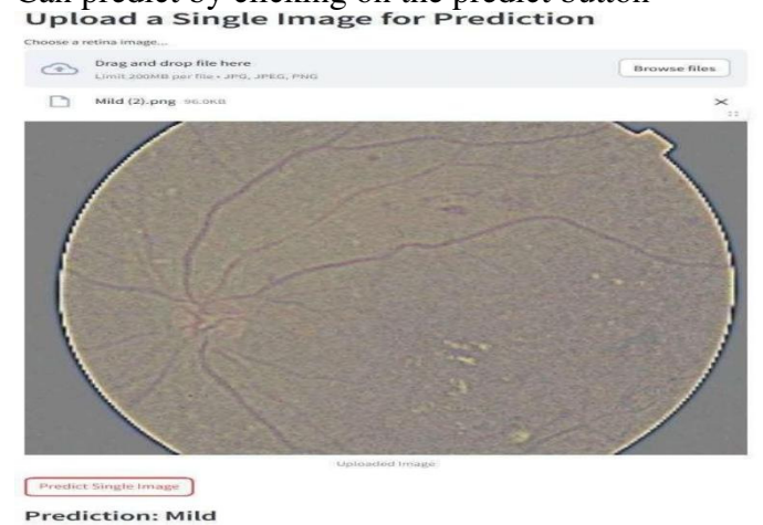
Fig 3: Predicting Single Image

This Fig 2 Website Allows You to Upload Model Of the project. Based on user interest upload a single image or upload the batch folder or Real-Time prediction after the upload is complete then, You Can predict by clicking on the predict button