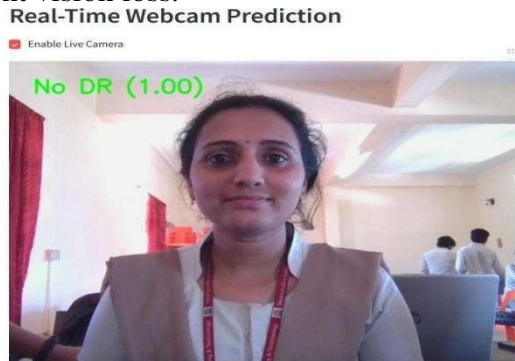
Fig 4: Real-Time Prediction

neural networks (CNNs) to analyze retinal features and provide an accurate diagnosis. Such an AI-driven tool can assist ophthalmologists in early DR detection, enabling timely medical intervention to prevent vision loss.