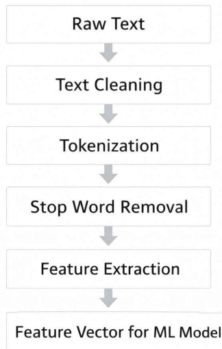
Fig. 2. Data Processing Workflow

One of the primary objectives of data processing is to transform the original text into numerical feature vectors that are able to be processed by machine learning algorithms, so that they can classify the emotions associated with the texts in question. The steps that are involved in this processing of data are numerous and include text cleaning, tokenisation of the text, stop word removal and feature extraction.