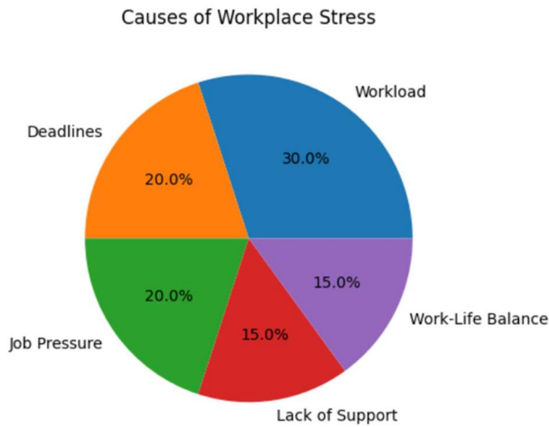
Chart 1 : Causes Of Workplace Stress

The following pie charts which provide a clear visual representation of the topic